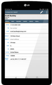
Mobile Badge Scanner