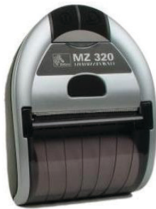
Optional Wireless Printer